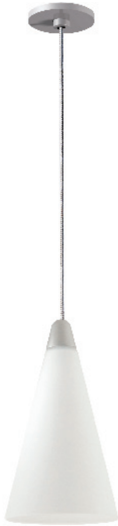
C1M (retrofit mounting plate)