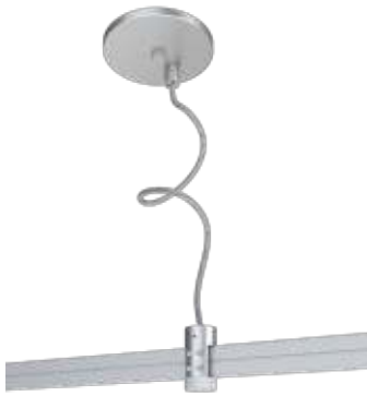
MC matte chrome