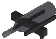
1B: Single Label View