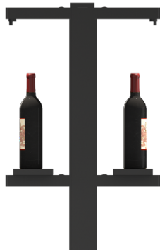
L183 in black (double sided)