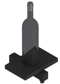
V: vertical view