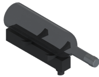
1A: Single Cork View