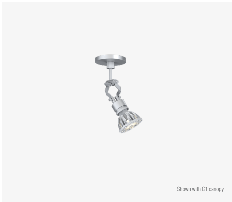
Shown with C1 canopy