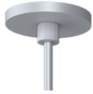
C1 2-3/8" (60mm) x 1/4" (6.35mm)