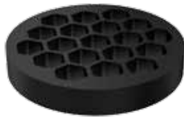
Black anodized (BA)