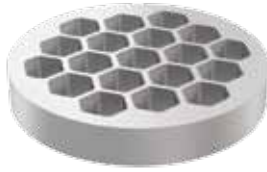
Matte clear anodized (MA)