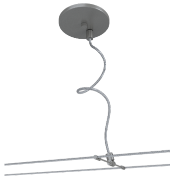
BN brushed nickel