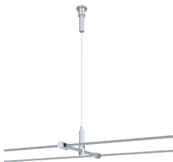
MC matte chrome