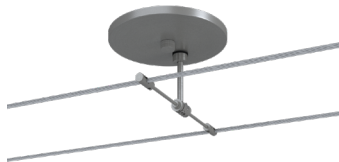
BN brushed nickel