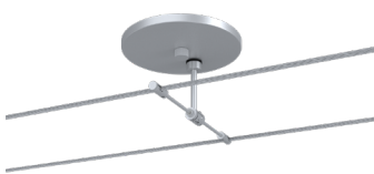
MC matte chrome