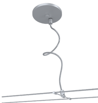
MC matte chrome