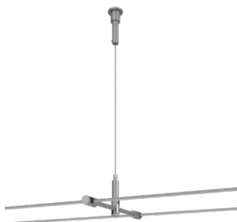
BN brushed nickel