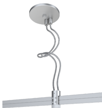
MC matte chrome