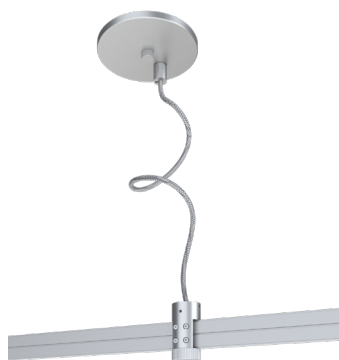
MC matte chrome