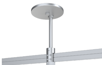
MC matte chrome