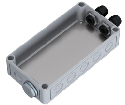
EBX-M180-GY enclosure box shown with cable gland and vent plug