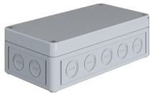
EBX-M180-GY enclosure box