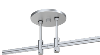
MC matte chrome