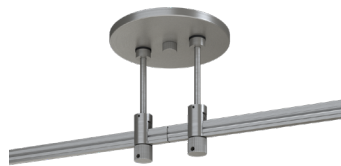
BN brushed nickel