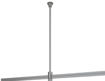
BN brushed nickel