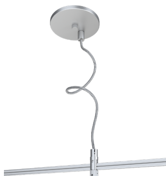
MC matte chrome