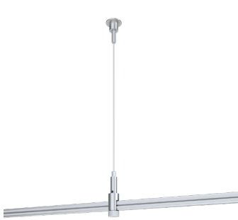
MC matte chrome