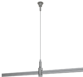
BN brushed nickel