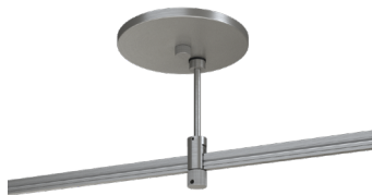
BN brushed nickel