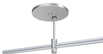
MC matte chrome