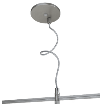
BN brushed nickel