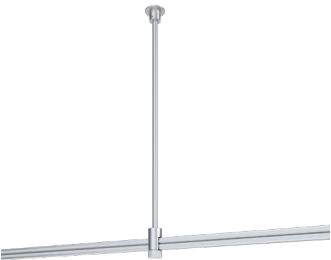
MC matte chrome