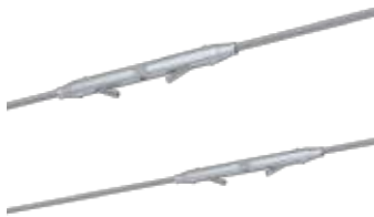
MC matte chrome