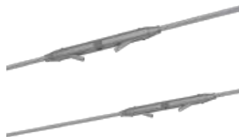
BN brushed nickel