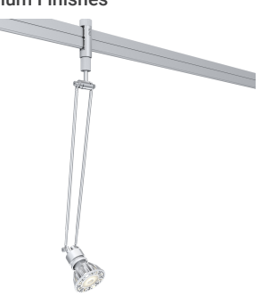
MC matte chrome