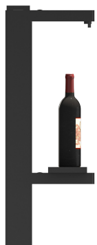
L183 in black (single sided)