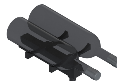
2A: double cork view