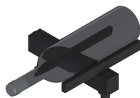
1B: Single Label View