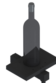
V: vertical view