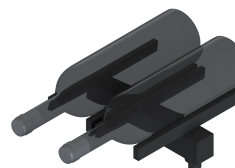
2B: Double Label View