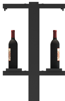
L183 in black (double sided)